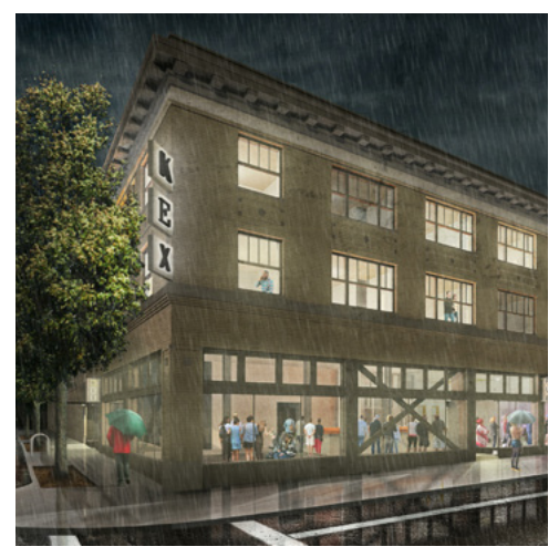
Exterior rendering of KEX Hostel Project